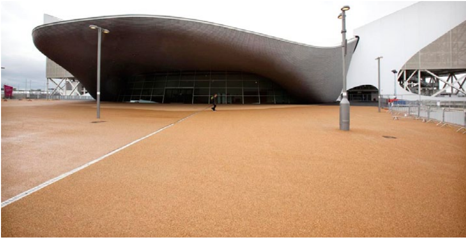
ACO channel drainage

With higher risk of corrosion from the sea air and sea water, the resin concrete used in the manufacture of ACO products offered a sustainable solution in this coastal area that would also preserve the aesthetics of the installations. ACO RoadDrain and KerbDrain products were extensively used throughout the regeneration project, covering roads, junctions and roundabouts in the area. Outside the reception area of the main WPNSA building ACO MultiDrain channel drainage was used to provide an efficient and effective solution with a traditional, aesthetically pleasing appearance to make it blend with the architectural feel of the site. Heel-safe gratings, ideal for the heavy pedestrian traffic in the area were manufactured from a composite material to also protect them from corrosion caused by salt water.