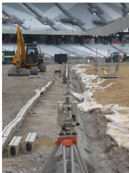
ACO drainage during installation.

ACO's ability to innovate and customise products to meet specific requirements was a benefit for the Westfield Shopping Centre development adjacent to the Olympic Park. In excess of 800m of drainage channel was provided covering the main shopping concourse, walkways, steps and bridges. Specially designed polymer concrete channels were fitted with discrete Brickslot gratings to meet the specific aesthetic requirements of the project with required hydraulic efficiency. The project gave another example of ACO expertise in providing bespoke solutions, working closely with its customers to ensure requirements for every aspect of an installation are met.